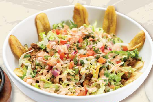
Carne Molida con Tajadas