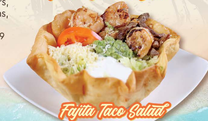
Fajita Taco Salad