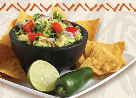
Table Side Guacamole