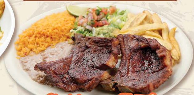
Chuletas con Tajadas