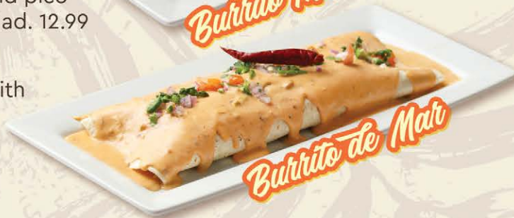
Burrito de Moli