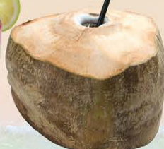
Fresh Green Coconut MP