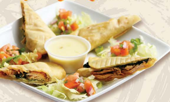
Mini Chicken Chimis