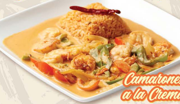
Camarones a la Crema

A tilapia fillet and shrimp served with rice and guacamole salad. 17.99