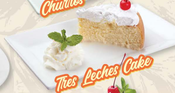
Tres Leches Cake