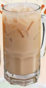
Horchata 3.99 Refill 1.99